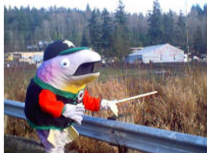
Bert the Salmon points out the disastrous results of years of not cleaning the ditch.

In our first issue of the Naked Fish, we featured Bert the Salmon pointing out the clogged creek.